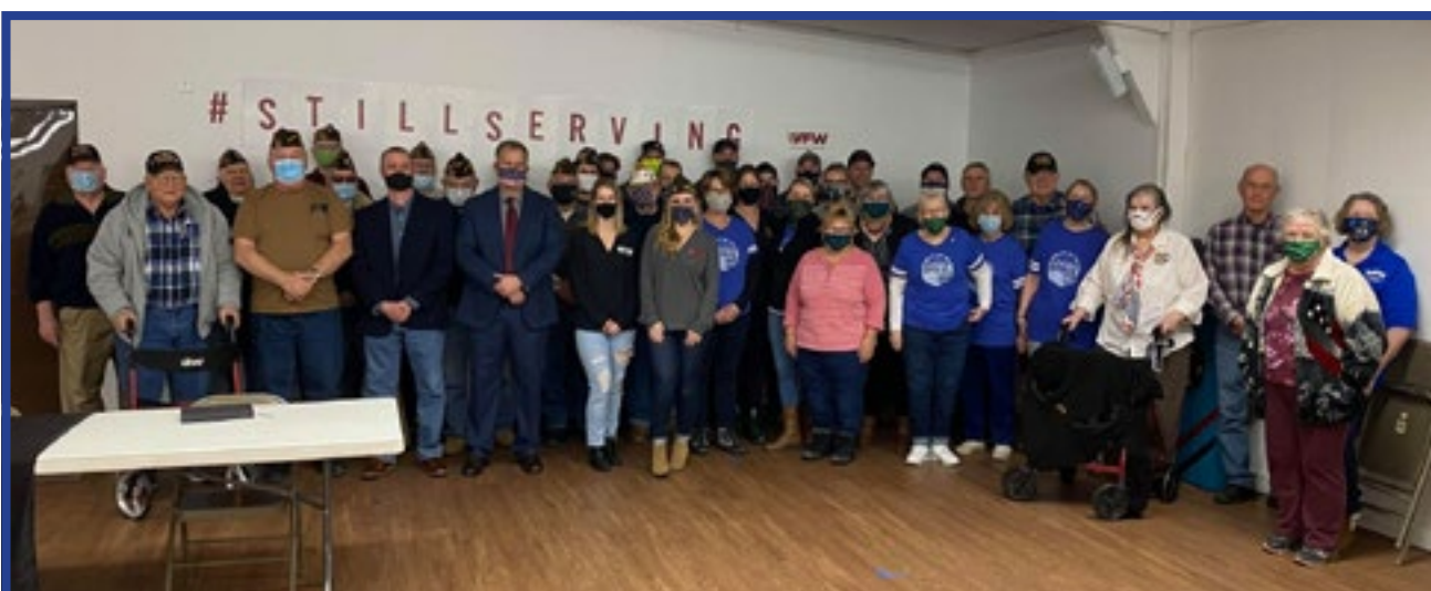
Post #3701 Lakeview earns National VFW Post of the Month for February 2021